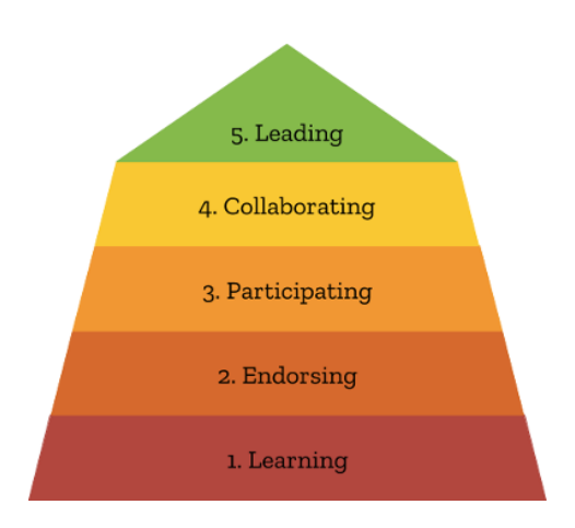
Figure 1 The OLE team's MoE, CC BY 4.0 by Mozilla

Once we had our visualization of the MoE, we asked: How can we operationalize this or make this more useful? In response, we developed a summary document (Figure 2) that helped us connect each band to examples, scores, and the types of community interactions and value exchanges that might show up within each level of engagement.